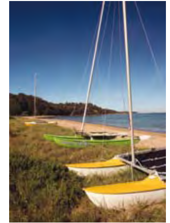
Catamarans at the eastern end of Long Beach

The pleasing result is that once on the beach you will likely be in total isolation - save for the occasional horse or dog - allowed on a time share basis at this end of the beach only. Still, there's plenty of room for everyone, it's a long beach!