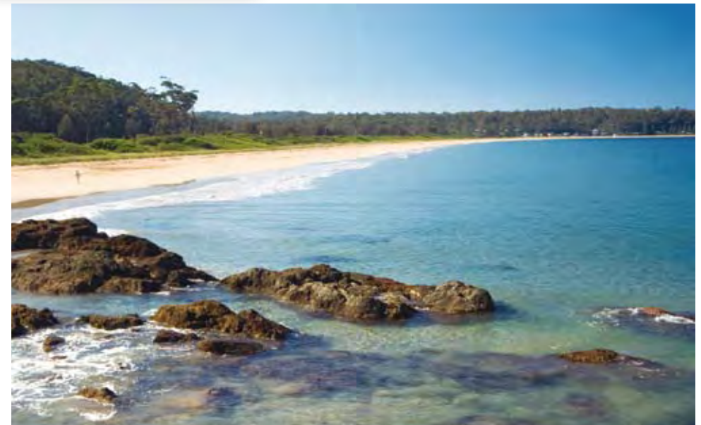
Opposite: View of Long Beach from the Chain Bay headland Above: Long Beach viewed from Square Head

The pleasing result is that once on the beach you will likely be in total isolation - save for the occasional horse or dog - allowed on a time share basis at this end of the beach only. Still, there's plenty of room for everyone, it's a long beach!