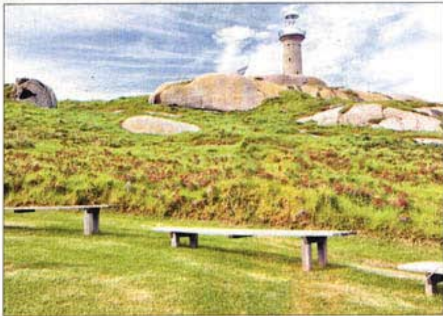
The rugged Montague Island is covered in detail.